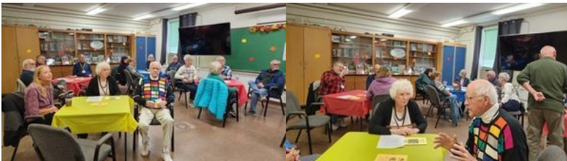
New ALL members learning more about ALL from board members, at the recent New Member meet and greet event.