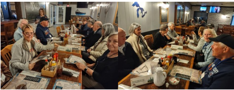
Octobers Moveable Feast featured the Lighthouse Restaurant in Roger's City. A nice respite after the Hammond Bay tour.