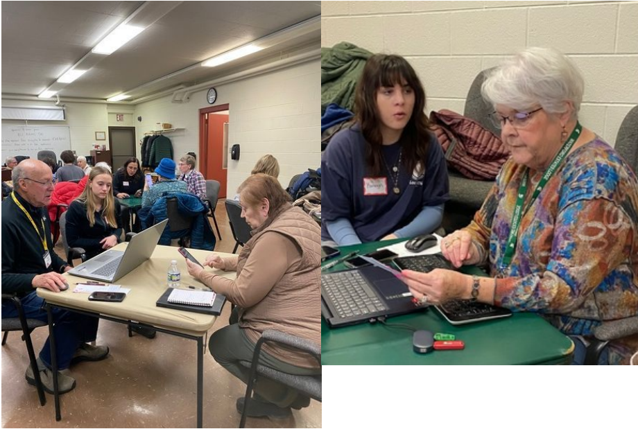
Here are ALL members learning about using their electronics from the Alpena Tech students.